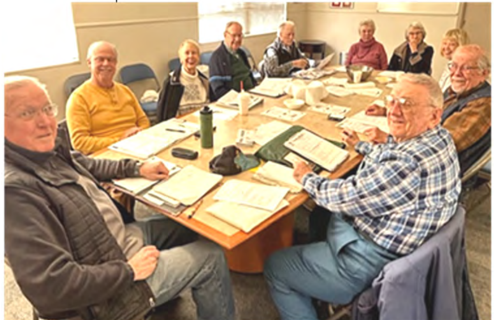
Above: MOAA Board meeting on March 7, 2023