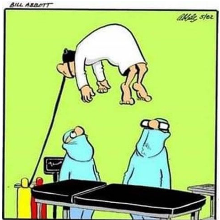
"Mental note, the yellow tank is helium."