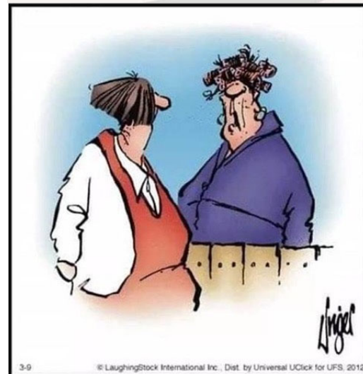
“He was very romantic when we first got married, but you know how men change.”